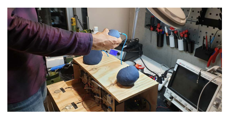
Figure 3: Three inflatables showing step counts of three different days

This idea was inspired by air occupying space, the compressed air expands into the space between cloth and the inflatable membrane to produce a stiff texture of the silicon balls and vice versa when deflated. The number of steps were converted to the amount of time in seconds that the solenoid valves need to be opened to fill the inflatables. A user interaction is shown in 3.